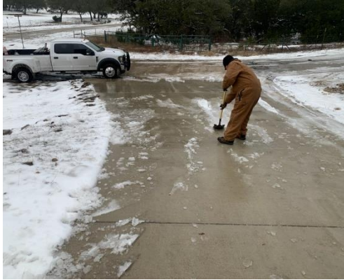
CLWSC employee clearing access to facility.

Situation: CLWSC followed its standard storm preparation protocols for freezing temperatures and inclement weather, including generator checks, topping of fuel tanks and putting as much water as possible into water storage tanks. The planning did not fully anticipate the extended duration and intensity of the freezing temperatures, and treacherous road conditions that made it difficult for our people to visit critical locations and transport generators to where they were needed.