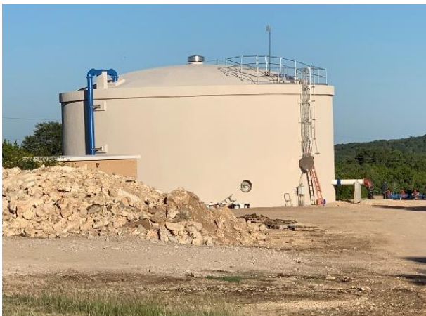
Newly built ground storage tank on FM 3159 will provide additional fresh water supply to Vintage Oaks and Meyer Ranch.