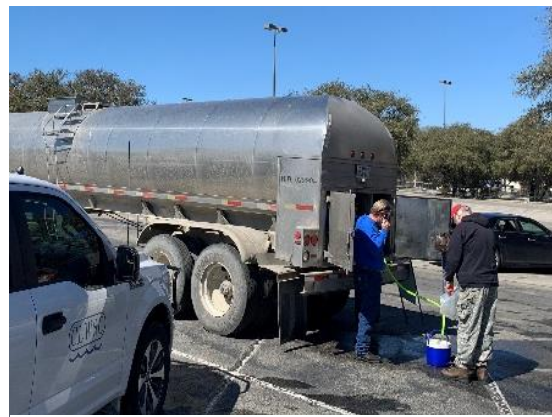
CLWSC employees worked with local water haulers to provide water for all residents in the county. Over 100,000 water bottles were distributed.