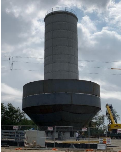
Elevated water storage tower under construction in the Ventana subdivision.