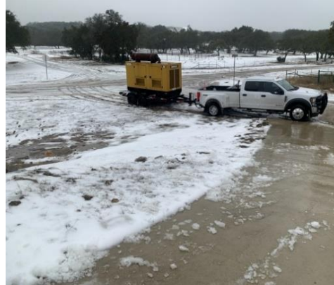
Portable generators deployed to water delivery facilities.