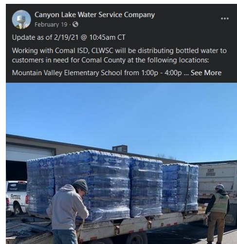
CLWSC Facebook page used to communicate bottled water locations in the storm's aftermath.