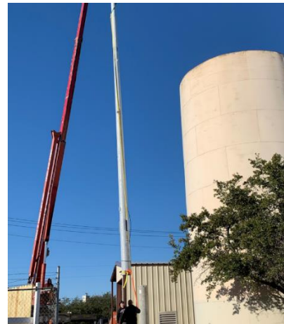
Fixed-based Advanced Meter Infrastructure (AMI) reader tower installed in Deer Creek service area. AMI helps customers quickly identify water leaks and is being installed in Canyon Lake service areas in 2021.