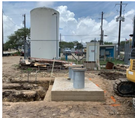
Ongoing work at the Point subdivision to expand water storage facilities.